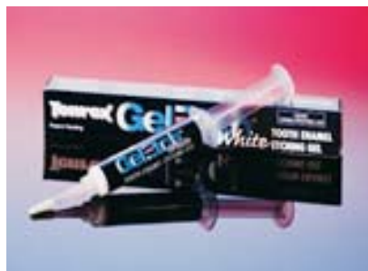
Temrex Gel Etch