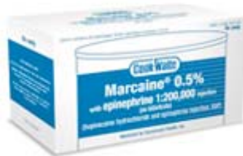
Cook-Waite Marcaine 0.5% w/epinephrine 1:200,000