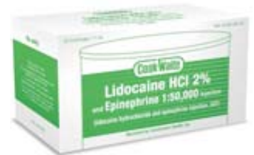
Cook-Waite Lidocaine 2% w/epinephrine 1:50,000