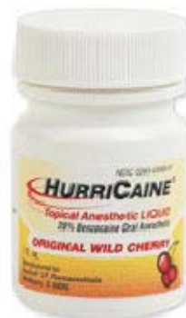
Hurricane Topical Anesthetic

$22.00 / 1 gallon bottle (cool mint/fresh burst)