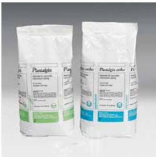
Septodont Plastalgin Alginate