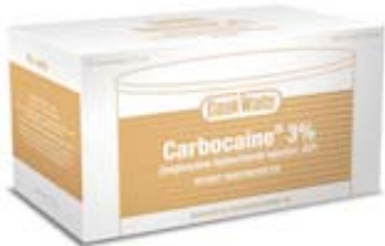
Cook-Waite Carbocaine 3%